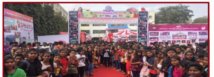
Trade Fair Day