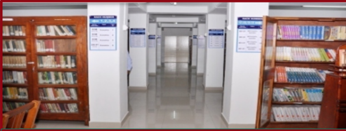
Dr. Karmaveer Bhaurao Patil Library

ट्रेडफेअर डे, उद्योजकता विकास कार्यक्रम, उद्योजक व शिक्षण संस्था यांच्या समन्वयातून उच्चशिक्षणाचा दर्जा उंचावण्यासाठी सतत प्रयत्न केले जात आहेत.