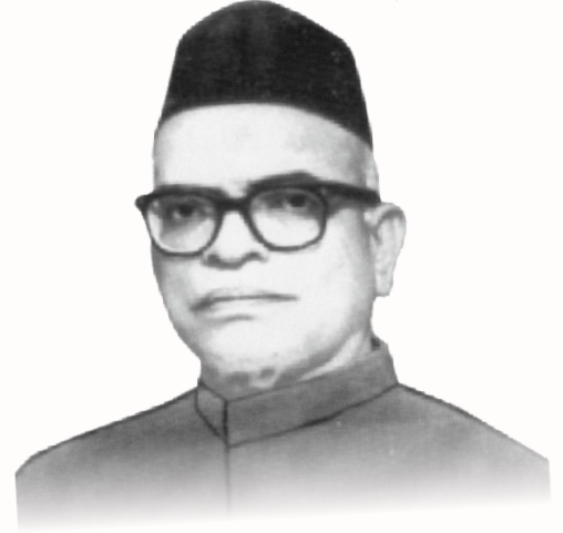
Hon'ble Dhananjayrao Gadgil