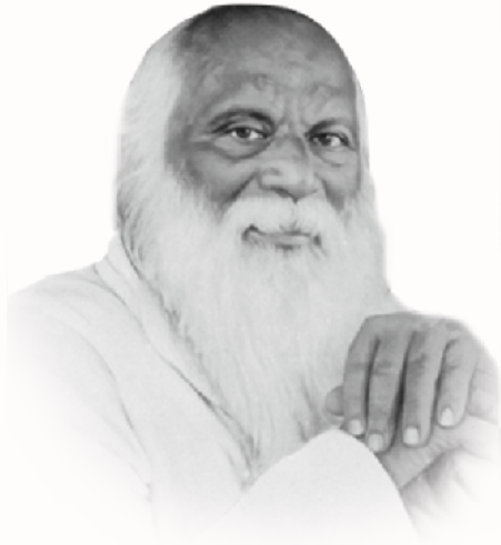
Padmbhushan Dr. Karmaveer Bhaurao Patil Founder, Rayat Shikshan Sanstha, Satara